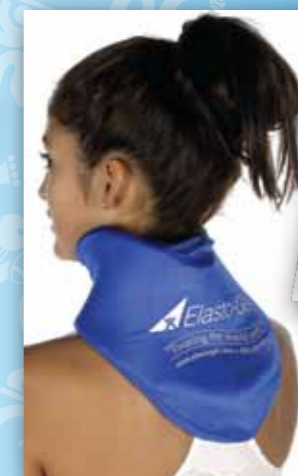
CC102 - Cervical Collar

Provides therapy for minor muscular and soft tissue cervical injuries.