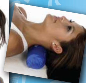
Support Rolls CP4001 - Sm 3"x10" CP4005 - Lg 4"x10"