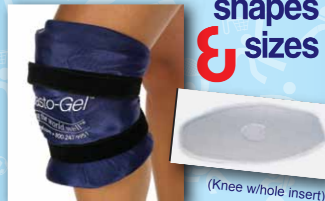
(Knee w/whole insert)