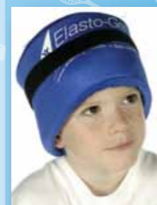
TW6001 - 4"x24" Therapy Wrap