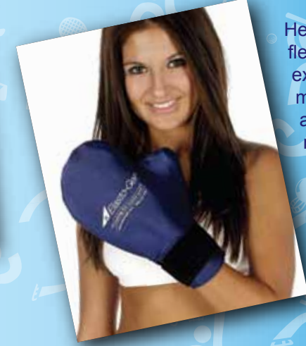
TM7001 Therapy Mitten

Heat helps to restore flexibility and provides excellent therapy for minor injuries during, and after rehabilitation exercises.