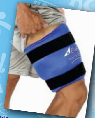
TW6010 - 9"x24" Therapy Wrap