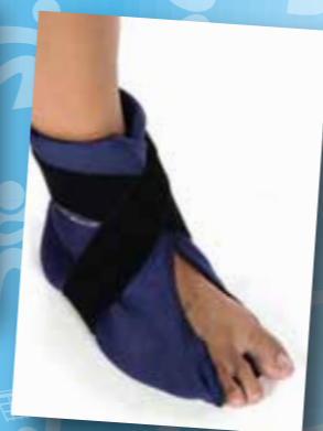
FA6080 - Foot/Ankle Wrap