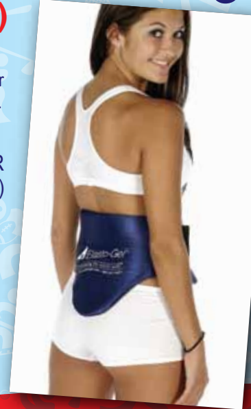
LW203 - LARGE (Waist 36" - 52")