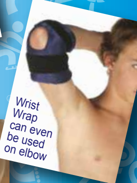
Wrist Wrap can even be used on elbow