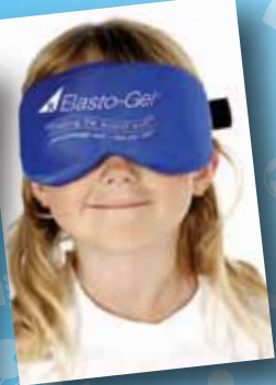
SM301 Sinus Mask