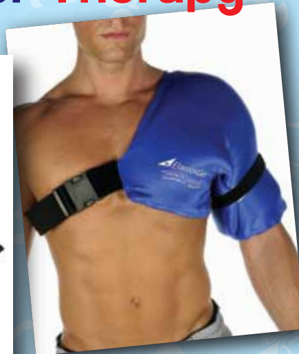
SW9001 - Shoulder Wrap SW9004 - Sm/Med Shoulder Sleeve SW9005 - Lg/XLg Shoulder Sleeve