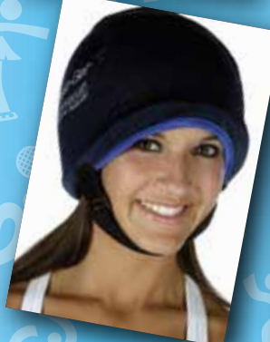
CAP610 - Helmet